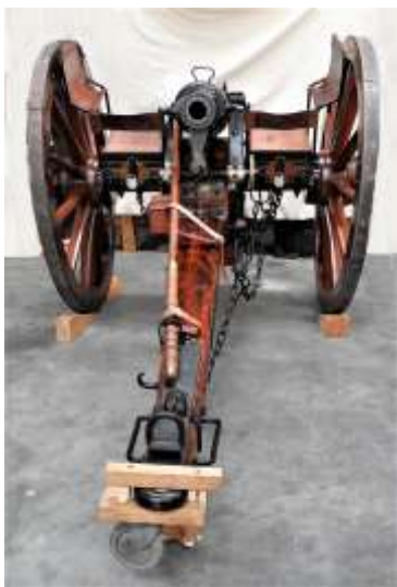
The 12 Pounder

https://artilleryhistory.org/moments_in_history/colonial_artillery/restoration_of_the_werribee_gun.html