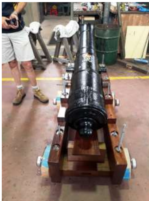
Port Jackson 4 Pounder

Another project that is nearing completion is the restoration of the Port Jackson 4 Pounder. The project involves the restoration of a 4-pounder gun barrel from the School of Artillery and the construction of a replica naval carriage. Work was carried out at North Head by volunteers and funded by the RAAHC. The barrel has been restored and the carriage is almost complete. COVID 19 has delayed the project but it will be completed and the restored gun moved back to the School. Thanks to Sydney Harbour Federation Trust (SHFT) support and the great work of the volunteers a valuable artefact has been preserved. A photo of the restored 4 Pounder is shown below.